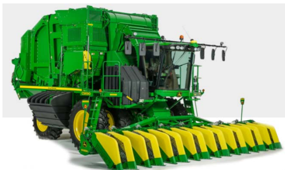
Figure 1 John Deere CP690

The Agricultural Transport and Logistics Working Group received representation from several peak bodies, including Cotton Australia and AgForce, to assist with the efficient and effective farm operations of agricultural vehicles needing to use a road to access farm holdings.