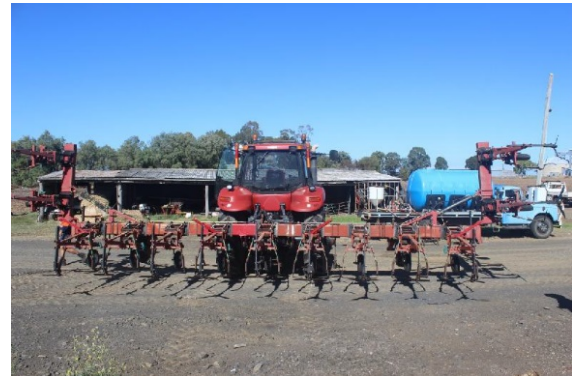
Figure 2 Example of farm-modified equipment

AgForce presented details showing that, as engine horsepower in agricultural vehicles has increased, the ability of these vehicles to utilise wider equipment in farming applications has also increased. A combination of farm-modified and new, imported equipment has created a need to move machinery up to 10 metres wide across and along the road network.