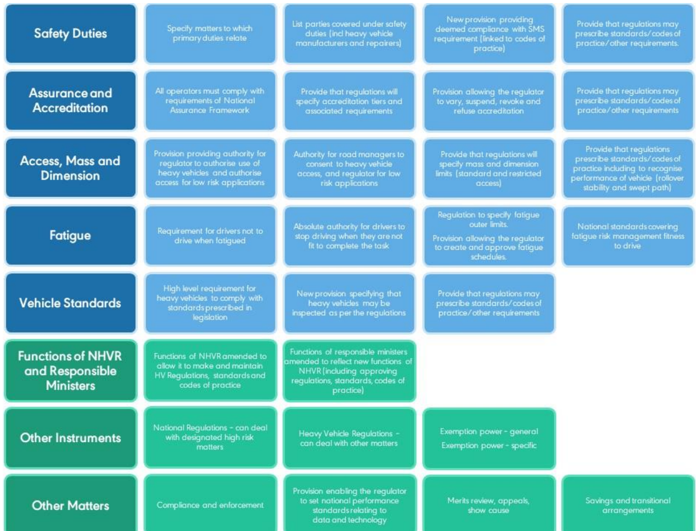
Diagram 2: Example of principles-based framework.

An example of how a principle-based framework (outcome focused) could be structured in key policy areas is outlined below. The information included in the diagram includes the detail that would be contained in the legislation.