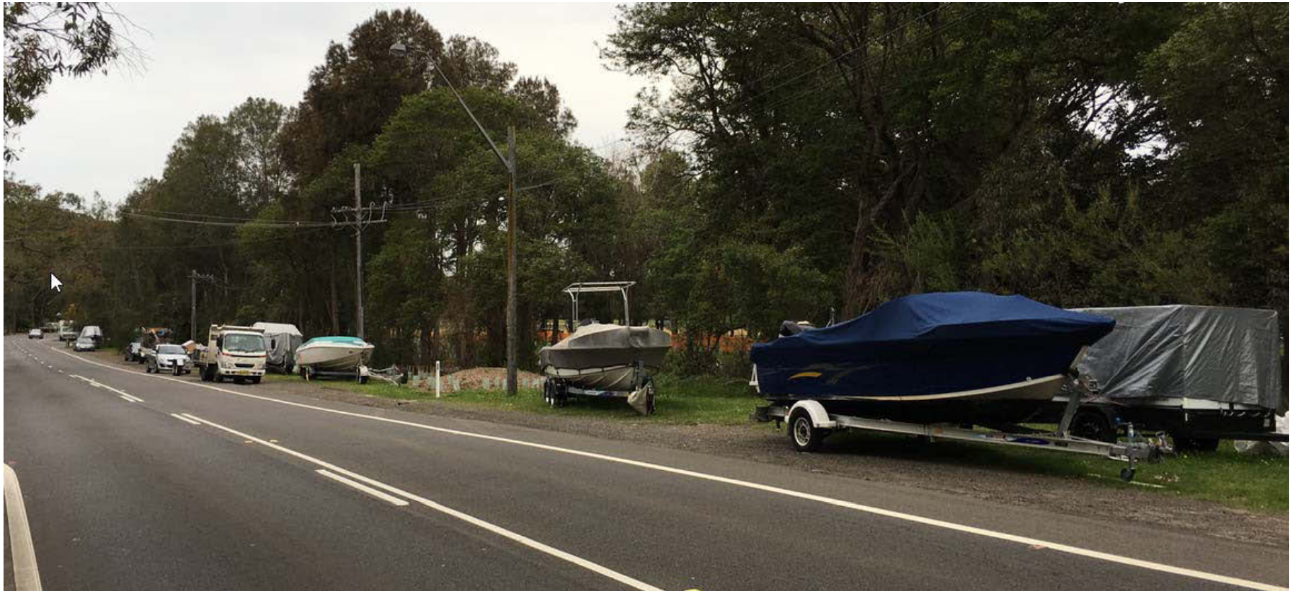
The entrance to Palm Beach Trailer Trash