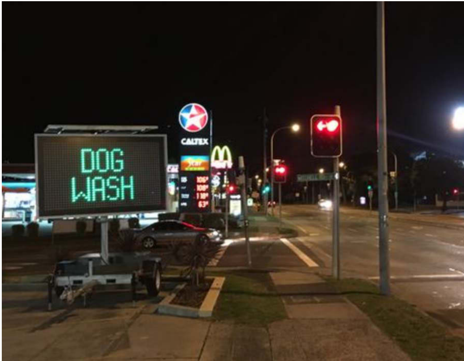
The Private Property Dilemma