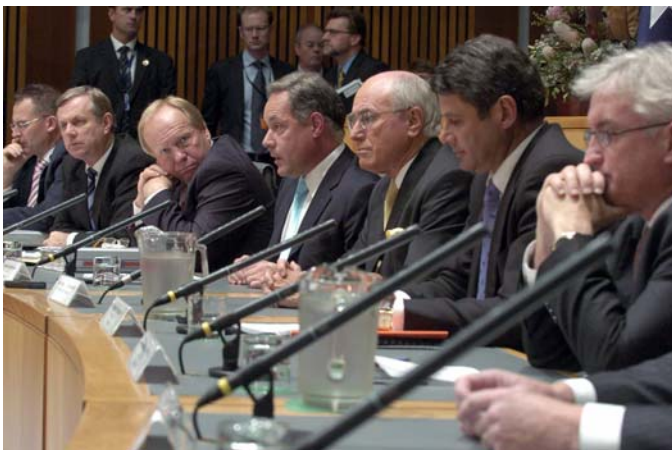
COAG agree on heavy vehicle charge principles (April 2007)